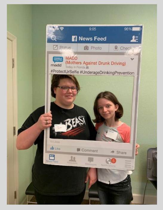
Day 3 - Tobacco Education Day